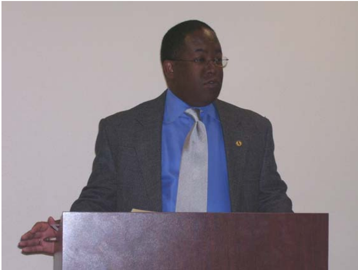
Above left: California Assemblymember and USC alumnus Mark Ridley-Thomas is the meeting's guest speaker, reflecting on education and the city of Los Angeles.